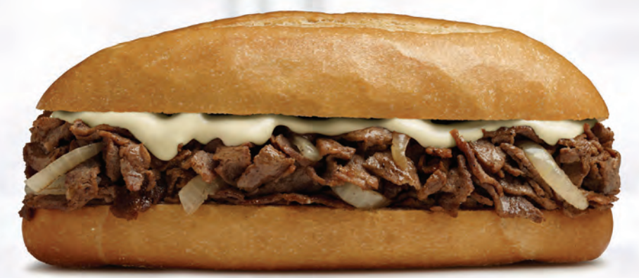
Cheese Steak Sandwich

YOUR MENU ISN'T COMPLETE WITHOUT AN ASTRA FOODS ORIGINAL PHILLY STEAK!