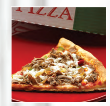
Cheese Steak Pizza